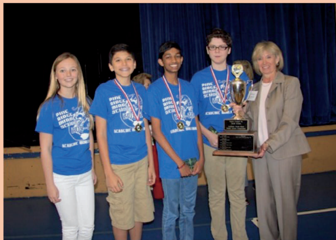
Pine Ridge Middle School 2014 Academic World Winners