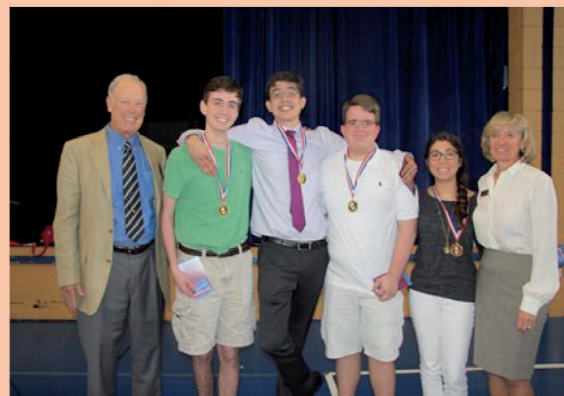
Barron Collier High School Winners of the 2015 Academic World Quest,