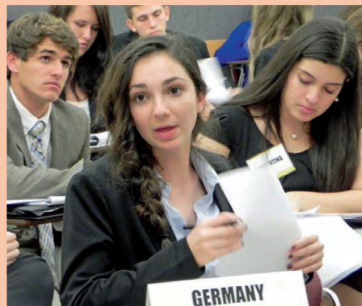
Students participating in the NCWA 2015 MUN competition at Florida Gulf Coast University