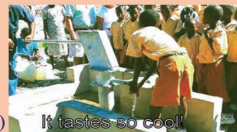
Building School for Children in Ghana