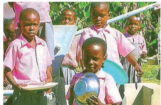
For the first time Luvana kids have fresh and clean water to wash their bowls and dishes.