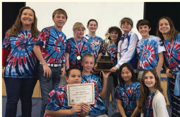
Students from Gulfview Middle School - the team won the First Place

The School Outreach Committee is a working committee with more than 20 dedicated members. As our workload never seems to diminish we are looking for new members who are interested in working with some of the best and the brightest always Collier County students. If you're interested please contact me at janguben@gmail.com .