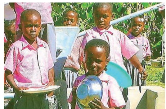
For the first time Luvana kids have fresh and clean water to wash their bowls and dishes.