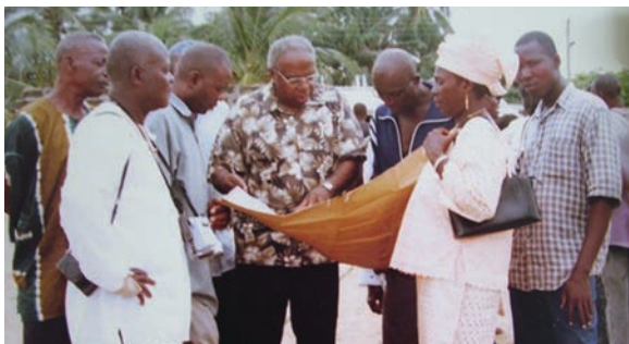
Ghana: Construction of the adult learning center in Whutin.