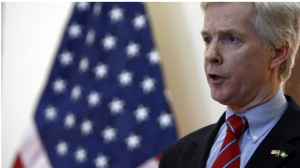
Ambassador Ryan Crocker

We will meet soon to begin the planning for next year and hope that the hurricane Season will be absent from our weather forecasts.