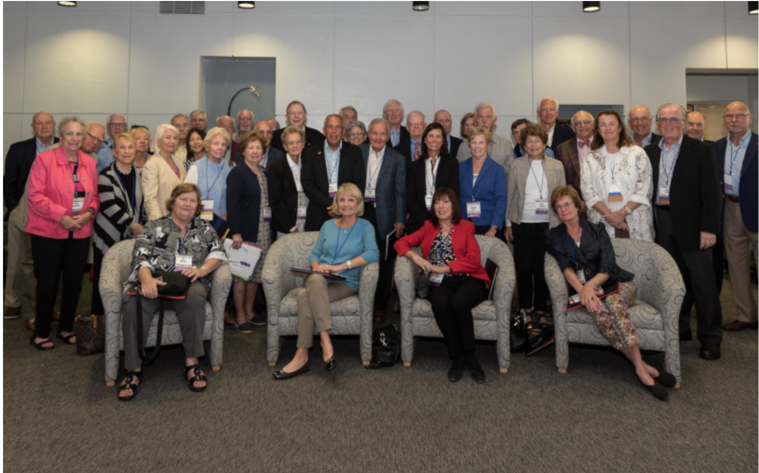
Model UN Program Judges

Finally, included below is a photo of the skilled and experienced judges who were so critical to the learning that occurred last spring. It is widely believed that the quality of the NCWA judges and the college scholarships provided by our members are the two factors that differentiate our MUN competition from all others.