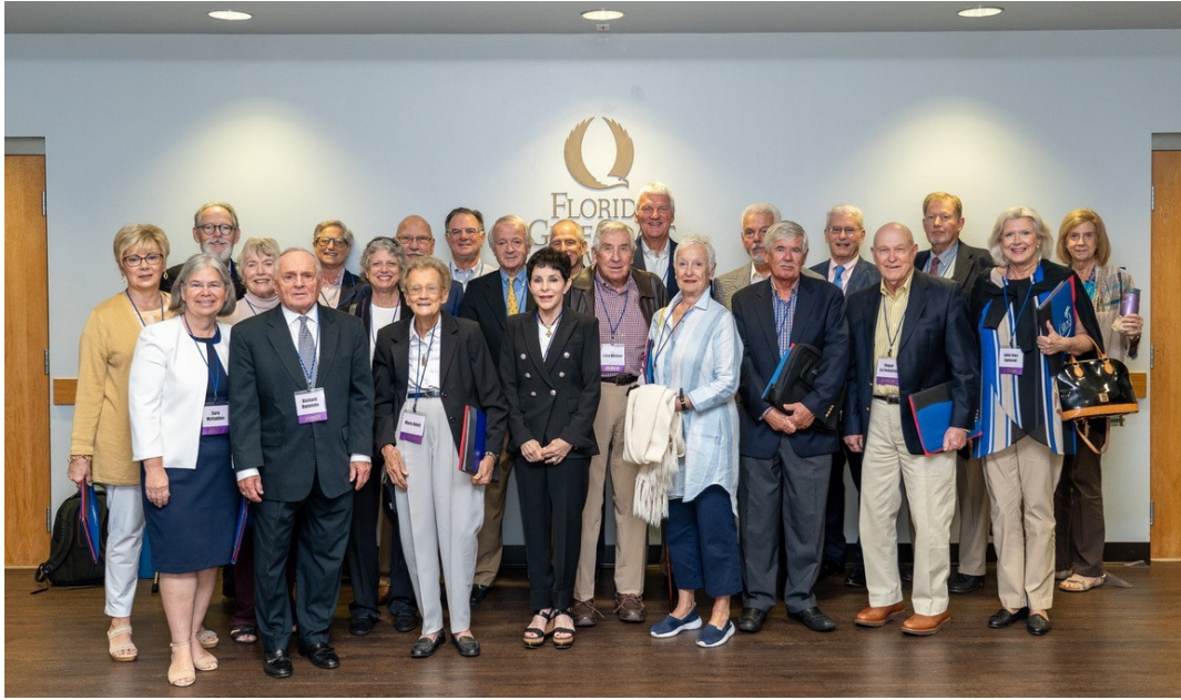
NCWA Judges for Merwin Hall Committee Sessions