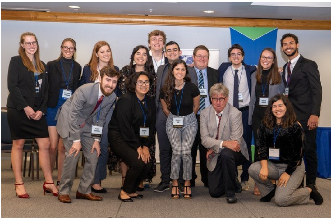
Florida Gulf Coast University Model UN Club Committee Chairs