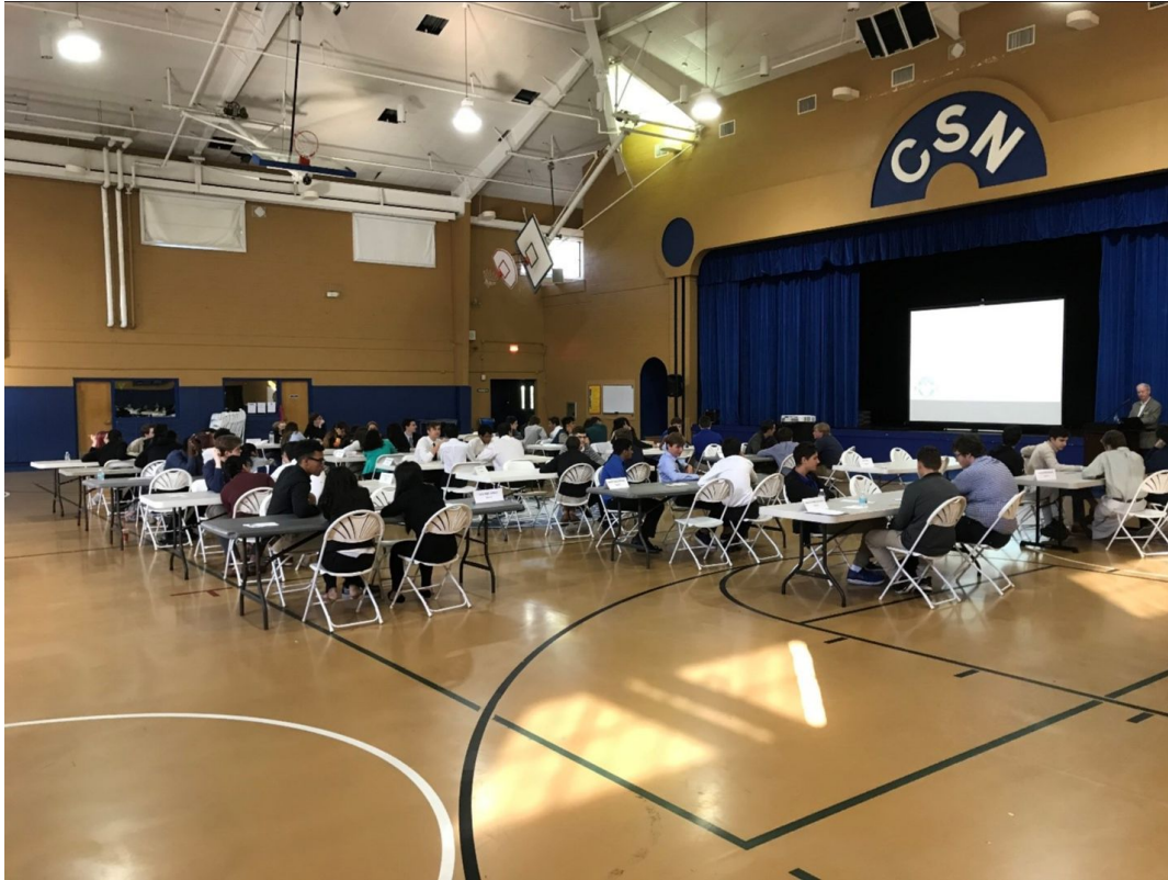
High School Academic World Quest at Mid-Question