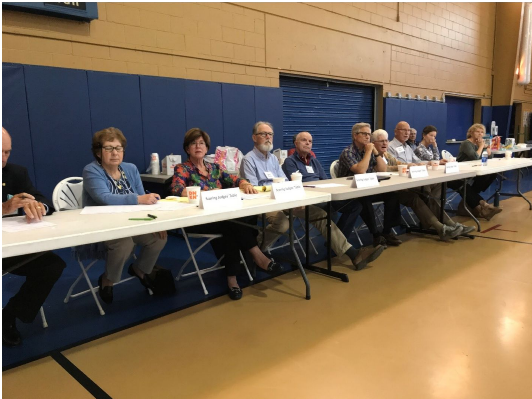
High School Academic World Quest Scorers Watch the Action

Traditionally, the Council sponsors the winning team to contend in the National Academic World Quest Competition in Washington, DC. Unfortunately, owing to the coronavirus pandemic, that competition was cancelled. But we still have plans to reward the winners accordingly, so keep checking back on our website for the award of the trophy.