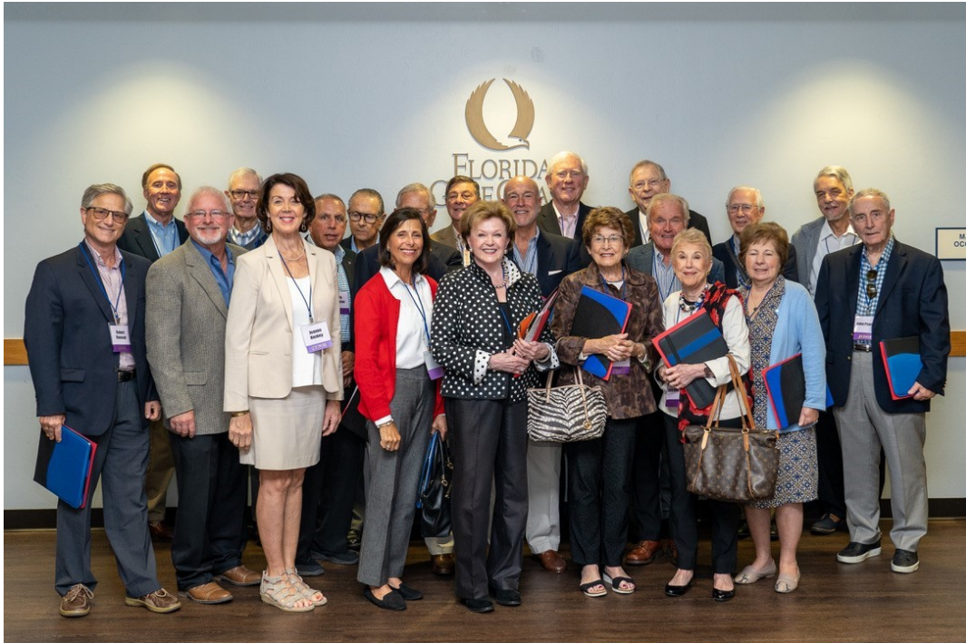
NCWA Judges for Lutgert Hall Committee Sessions

The disproportionately large number of women and persons of color that came on the stage to accept the approximately $40,000 in financial awards was especially notable and demonstrated that NCWA programs like Model UN reach all demographics of Southwest Florida's youth.